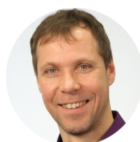
Dr. Oliver Bierwagen

Can the crystal structures of pharmaceuticals be predicted? Department of Chemistry University College London, London, United Kingdom